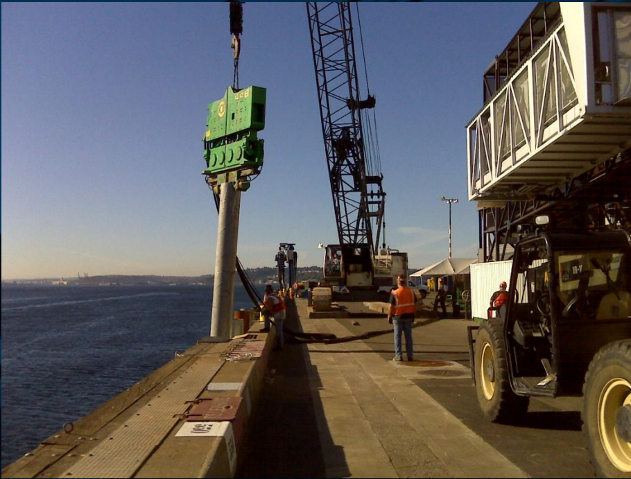
Steel Reinforcement Pile Placement August 2009