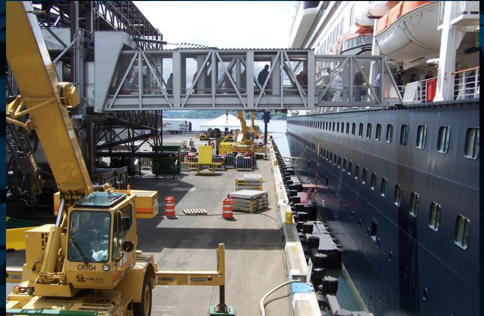
Current Fender Systems with Steel Camel Barges